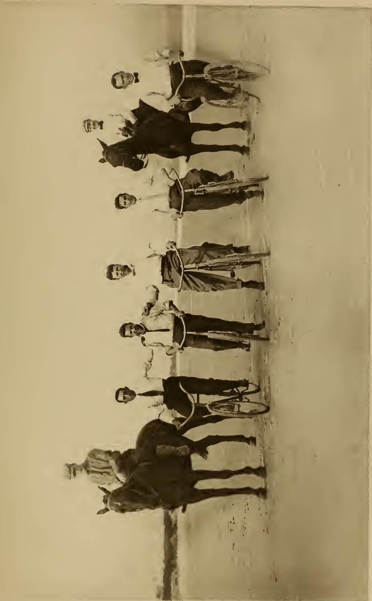
ATLANTIC OCEAN BEACH